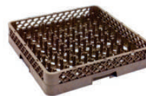
TYPE: E64 (3123) Pin Rack (untuk piring, mangkok) Dimensi: 50 x 50 x 10 cm