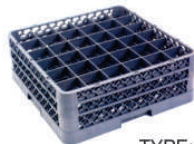
TYPE: E36-3 (3138) Cup Rack (untuk gelas) Dimensi: 50 x 50 x 18,5 cm Dimensi ruang: 7.5 x 7.5 x 16.1 cm