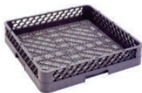
TYPE: E4 (3116) Flat Rack (U/ garpu & sendok) Dimensi: 50 x 50 x 10 cm