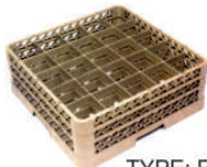
TYPE: E25-3 (3135) Cup Rack (untuk gelas) Dimensi: 50 x 50 x 18.5 cm Dimensi ruang: 9 x 9 x 16 cm